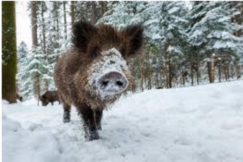
CTV Feral Pigs