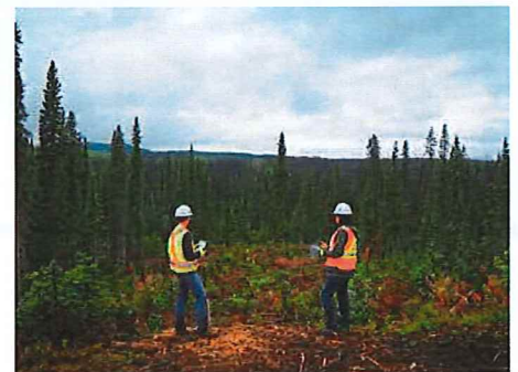
CGL's Environmental Team along the project route

energy sources, and global demand is projected to rise significantly over the next 20 years. It's estimated that natural gas exports facilitated by Coastal GasLink could reduce annual global CO2 emissions by 60 to 90 million tonnes, which is roughly equivalent to removing up to 12 to 18 million cars off the road. This also represents more than the total annual emissions of B.C and roughly 10 per cent of Canada's annual emissions. This provides an opportunity for British Columbia to help replace higher carbon-emitting fuels, such as coal, with cleaner energy sources, contributing to the global effort to mitigate greenhouse gas emissions and reduce air pollution.