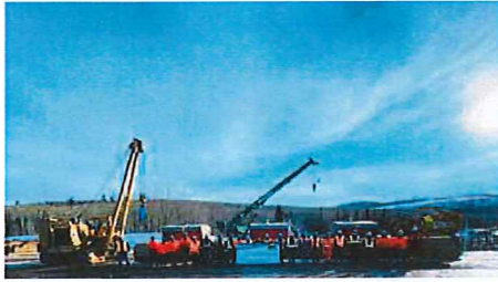
Nadleh-Macro crew members

One of the leading pipeline construction companies, Macro Pipelines, embarked on a partnership with Nadleh-Whut'en and its long-time partner Frost Group, for construction in Section 5.