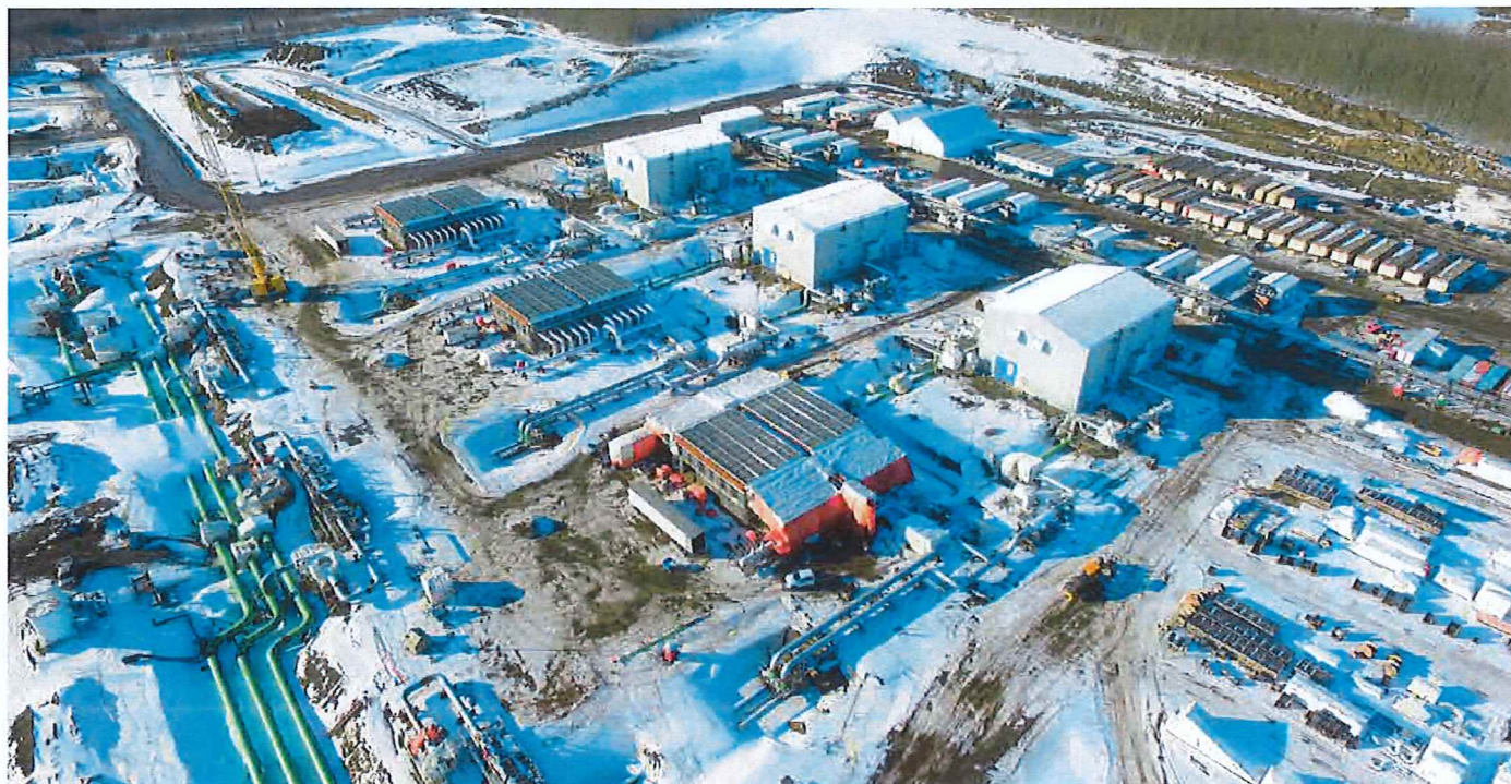
Aerial View of the Wilde Lake Compressor and Meter Station

Delivering a world-class project that will provide natural gas to Overseas markets wouldn't be possible without the Wilde Lake Compressor and Meter Station.