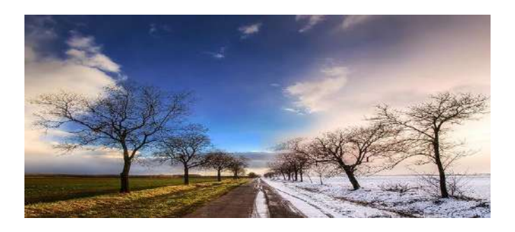
Spring... ever changing season for us Northerners!